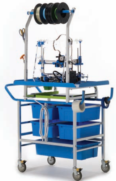
Base 3D Printer Cart (back view)