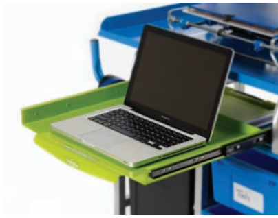
Sliding laptop tray