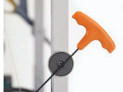
Magnetic tool holders