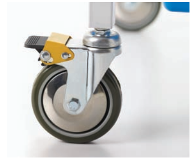
4" Casters, two locking