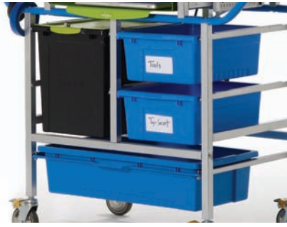
Compact storage - Open Tubs, a Really Big Tub and an optional Tech Tub™