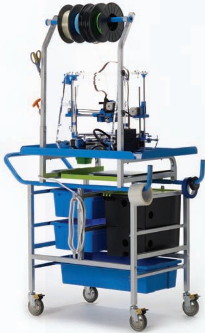
Premium 3D Printer Cart (back view)