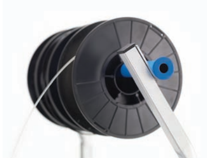
Adjustable Spool (holds 4 spools)