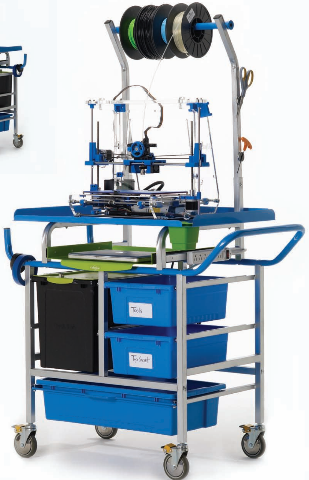
Premium 3D Printer Cart (front view)