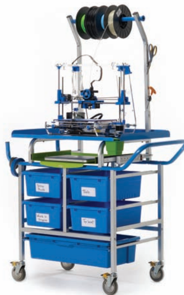
Base 3D Printer Cart (front view)